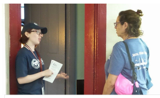
CRS student ambassador welcomes participant to Refugees Seeking Safety Stimulation.

pilgrims, which was featured in a Catholic Standard article "Krakow in the Capital festival brings World Youth Day to Washington". This simulation was created by CRS Student Ambassadors at Cabrini University to educate participants on the issues facing refugees, especially unaccompanied minors, fleeing gang violence, domestic abuse and drug cartels in their home countries of Guatemala, Honduras and El Salvador.