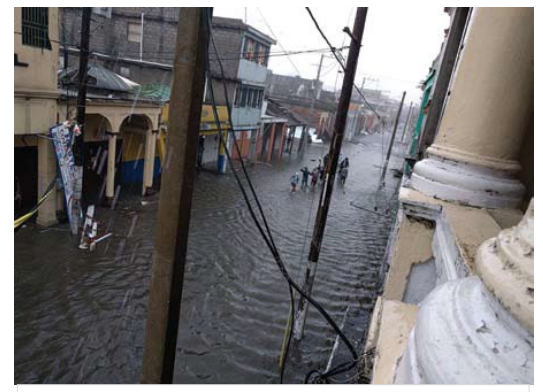
Hurricane Matthew killed as many as 900 people and destroyed tens of thousands of homes in Haiti.

This emergency update captures the latest information from CRS teams responding to new and ongoing emergencies. You will find an update on Hurricane Matthew from CRS teams in Haiti, as well as the latest from Iraq, the Middle East and Europe in response to ongoing crises in the region. From Africa, you'll find an update from South Sudan, Ethiopia, and the West and Central African countries affected by Boko Haram. An update from