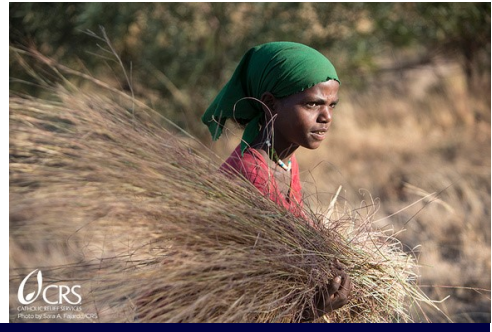
Volume 15, Issue 4